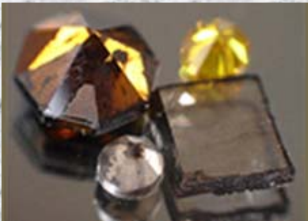
Geophysical Laboratory, Carnegie Institution of Washington

GEOCHEMISTS ARE GROWING LARGE, HIGH-QUALITY DIAMONDS WITH THE PROSPECT OF WIDESPREAD APPLICATIONS IN EVERYTHING FROM CUTTING TOOLS TO ELECTRONICS.